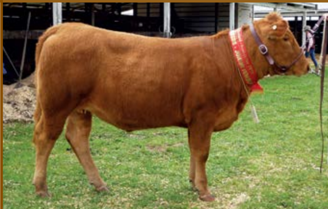
Wainuka Salvia 1531 - Other Breeds Champion Junior Female- Hawke's Bay Show