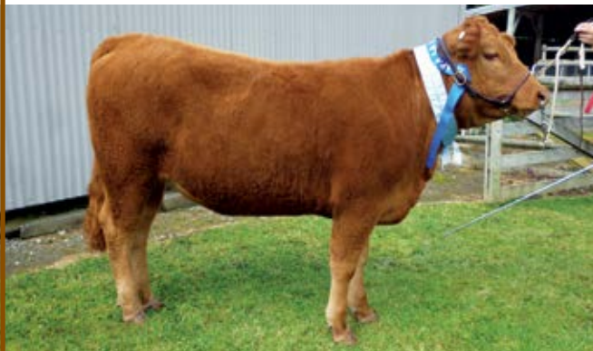
Woodah R Pansy 15015 – All Breeds Reserve Champion Junior Female- Wairarapa Show

Both Wainuka Salvia 1531 and Woodah R Pansy 15/015 were purchased at Beef Expo this year. It is pleasing for the new owners to have them both proving their worth in the show ring and are a credit to their breeders.